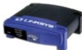
LINKSYS ETHERFAST® CABLE/DSL ROUTER

In many ways, a router functions like an Internet post office. When it receives a packet of data, it reads the packet's destination address. To determine how